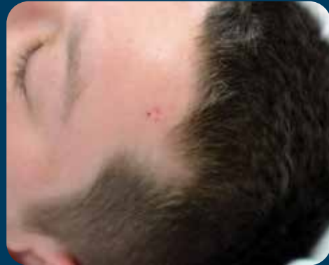
10 seconds after removal