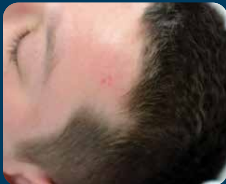
30 seconds after removal