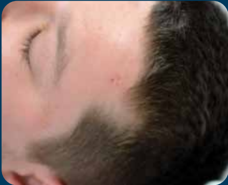
Immediately after removal