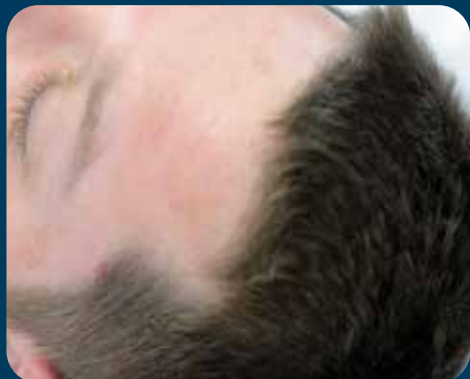
2 minutes after removal